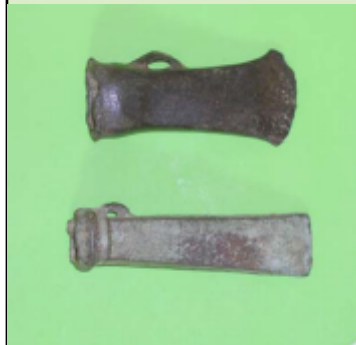
A pair of bronze Age Socketed axe heads found by members of the Blundell family in the locality

interest in archaeology and local history there is a wealth of interesting observations about discoveries of artefacts and changes in the environment over the centuries and millennia.