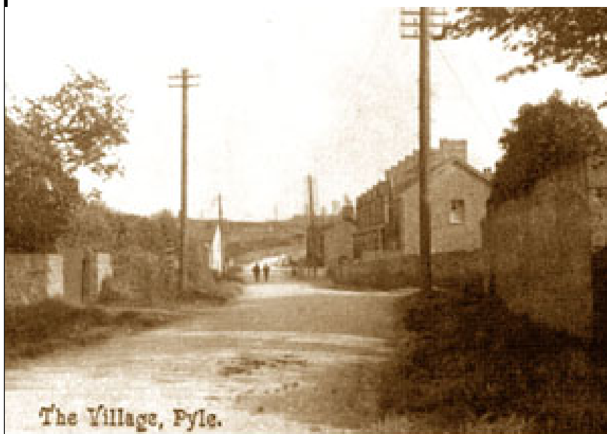
The Village, Pyle.

A view of Pyle Village about a hundred years ago. This picture was taken from near the Cross and looking south towards Stormy. There seems to be no street lighting and in spite of this being the main road to Cardiff there is little to be seen on it except what appears to be some horse manure in the foreground and two figures walking in the whose walk along the road is uninterrupted by any traffic. Just as well judging by the absence of any pavements!